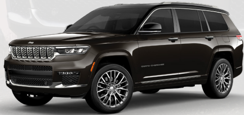
PFJ - Rocky Mountain (Option - Customer Order Only)