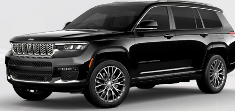
PXJ - Diamond Black (Option)