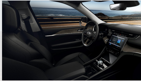
ALX7 - Black Capri Leather-trim (Standard - Limited)