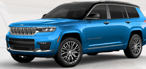
PBJ - Hydro Blue (Option - Customer Order Only)