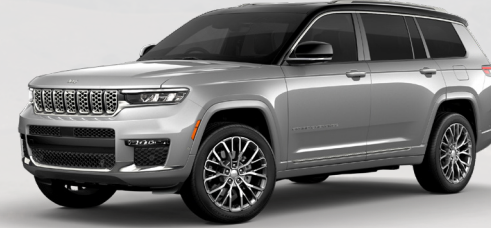
PSE - Silver Zenith (Option)