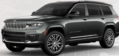
PAS - Baltic Grey (Option)