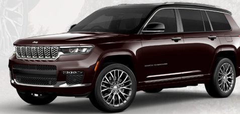
PHC - Ember (Option - Customer Order Only)