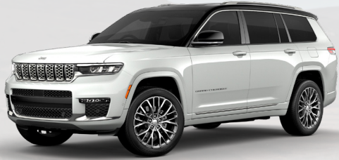
PW7 - Bright White (Standard)