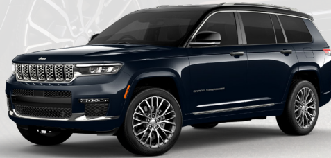
PCQ - Midnight Sky (Option - Customer Order Only)