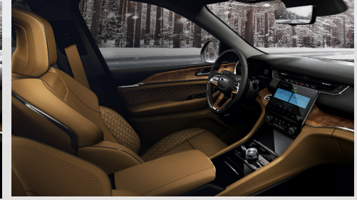
ECT7 - Tupelo Palermo Leather-trim (Option - Summit Reserve)