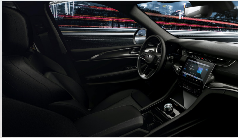
KLX7 - Black Leather-trim (Standard - Night Eagle)