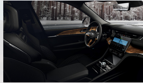
ECX7 - Black Palermo Leather-trim (Standard - Summit Reserve)