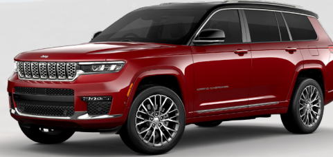
PRV - Velvet Red (Option)